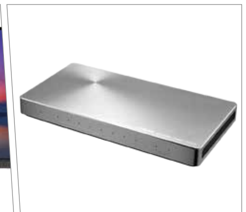
Hyper-Fast Networking (XG-U2008)