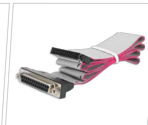
ASUS Parallel Port Cable