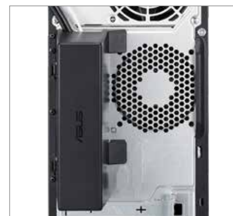
ASUS Back I/O Protector