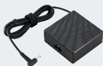
ASUS 90W Universal NB Square Adapter