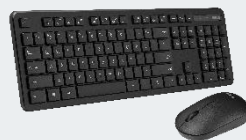
ASUS Wireless Keyboard and Mouse Set CW100