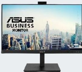
ASUS BE279QSK Video Conferencing Monitor