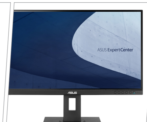
ASUS BE279CLB Business Monitor