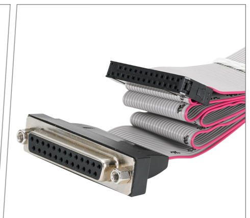
ASUS Parallel Port Cable