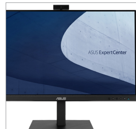
ASUS BE279QSK Video Conferencing Monitor