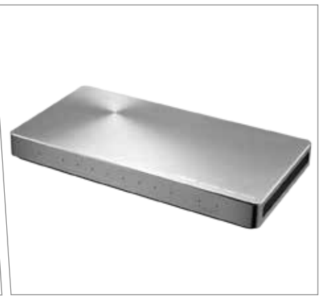
Asus 27" Eye Care Monitor (VP279N) ASUS 27" Business Monitor (BE279CLB) Hyper-Fast Networking (XG-U2008)